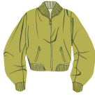
a jacket jakna