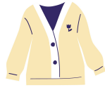
a cardigan jopica