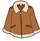
a winter coat zimski plašč