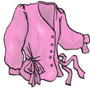
a blouse bluza