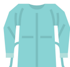
dressing gown spalno pregrinjalo